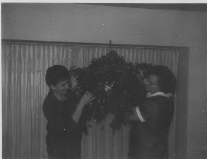
Blue Ribbon Horticulture Entry made in Class 15 - Hanging Planters